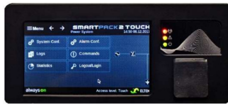
Smartpack2 Touch Master (interface unit)