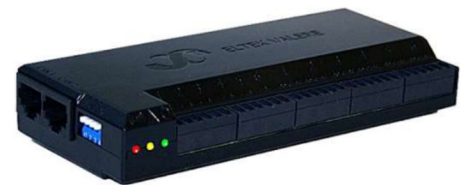
I/O Monitor2 (alarm I/O unit)