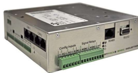
Smartpack2 Basic Industrial (data aggregation unit)