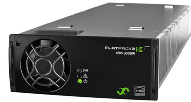
Flatpack2 HE Rectifier

HE rectifiers feature typical efficiencies higher than 95% (the 48V/2000W module typically performs higher than 96%). See the respective datasheets for more detailed specifications